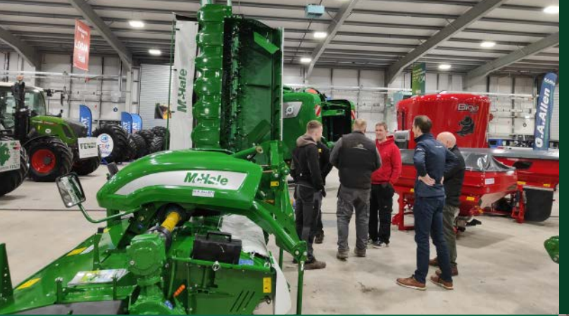
"WE COME TO THIS SHOW EVERY YEAR AND EACH YEAR IT GETS BETTER AND BETTER! WE ARE LOOKING FORWARD TO THE 2025 SHOWS"

"THIS EVENT HAS WORKED REALLY WELL, THERE HAS BEEN ALOT OF EXISTING AND NEW CUSTOMERS THROUGH THE DOOR, GREAT SHOW"