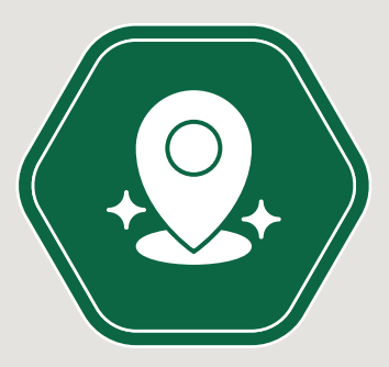
The SFM show is in a world-class venue easily accessible by car, train, bus, and plane